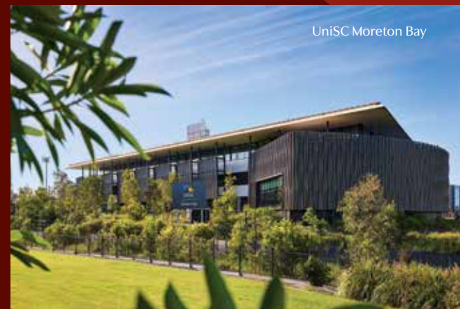
UniSC Moreton Bay

The Moreton Bay Region is also known for it's outdoor lifestyle. Enjoy easy access to Redcliffe and Bribie Island, gateway to the aquatic playground of Moreton Bay. Soak in beautiful beaches, swimming, surfing or a day on the water fishing and boating.