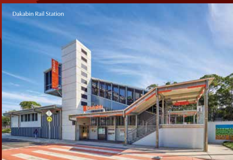
Dakabin Rail Station